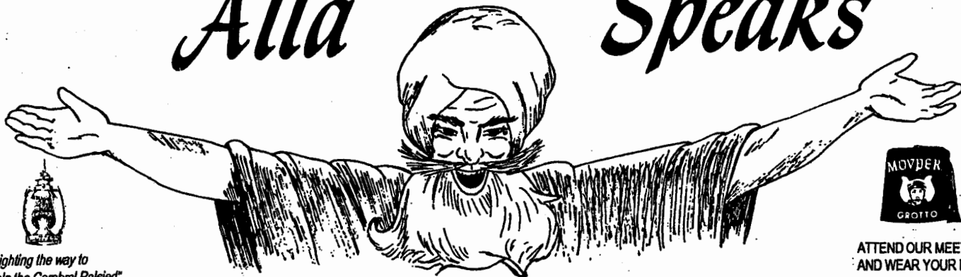
"Lighting the way to help the Cerebral Palsied"